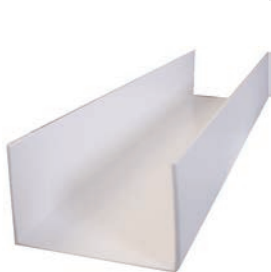
2-1/4" Base Channel EPI0125