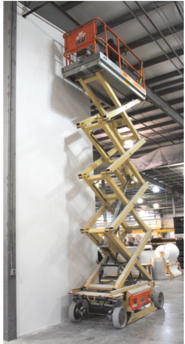
24 Foot High Partition Wall Installation