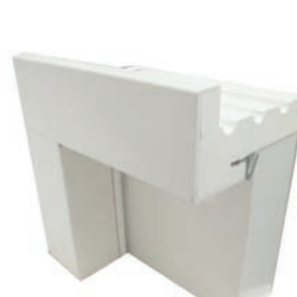
2-1/4" Door Frame OPTIONS