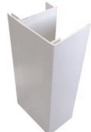
2-1/4" Fitted Outside Corner P0225