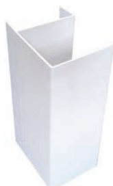
2-1/4" Slip-on Outside Corner P0226