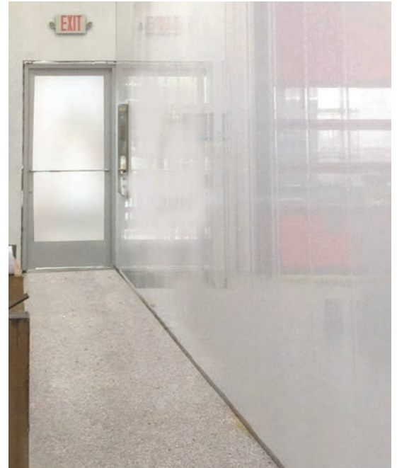
2-1/4" P224 Partition Wall Installation