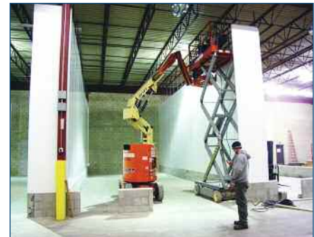
Steel Reinforced Attached to Building Structure