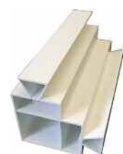
Dovetail Corner EPI1090