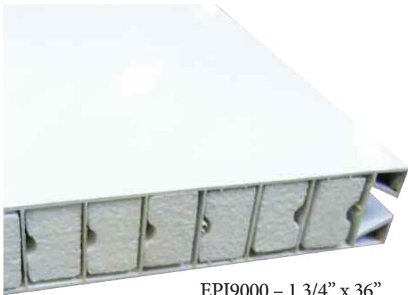
EPI9000 – 1 3/4” x 36” Insulated Wall Panel

Our Demountable PVC Wall System can be used in new construction or rehab projects, and allows you the flexibility to construct interior walls faster, easier, and safer, wherever you need them. Clean rooms, food processing and agricultural facilities, and dairies are prime candidates for this system. Use whenever high moisture, acidity, salt, rust, rot, and corrosion are a problem.