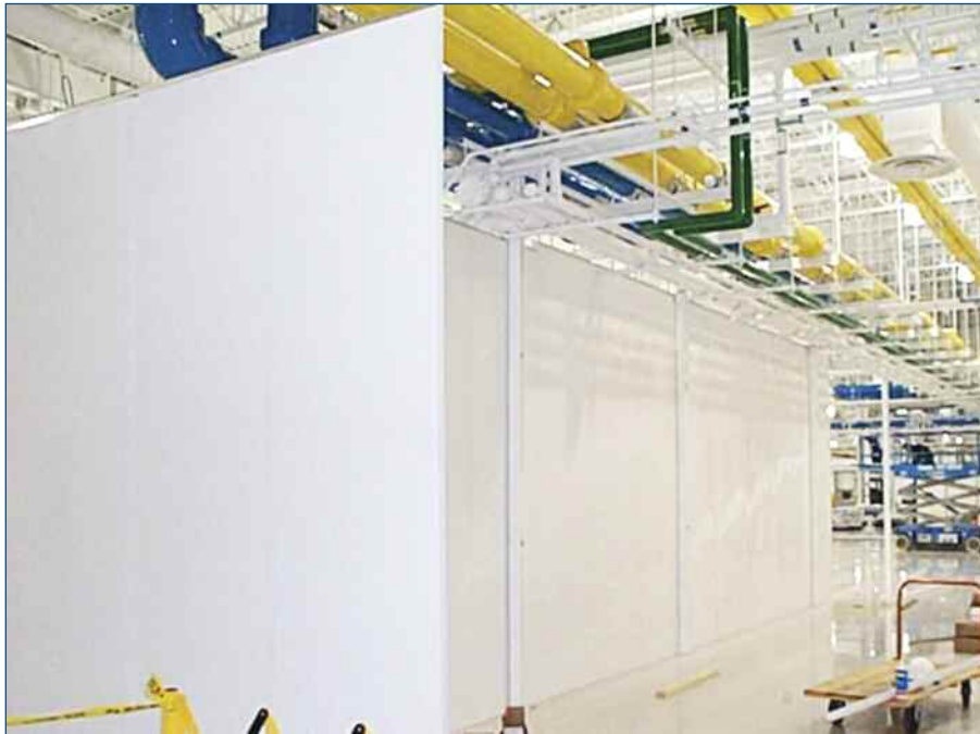
Process Room – Installation of 12 foot high panels.

Extrutech Demountable PVC Wall Panels have a smooth, non-porous, glossy surface on both sides, perfect where sanitation and cleanliness are critical. Panels also help improve overall reflective lighting. Available options include insulation and internal steel reinforcement for extra stability and support. Each panel is cut to customer specification, up to 24 feet. Panels are 100% recyclable and do not support mold or mildew per ASTM D3273 and D3274.