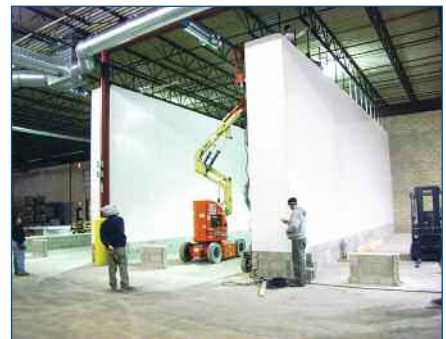
17 Foot High Panels on 2 Foot Block Wall