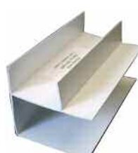
Outside Corner EPI1095