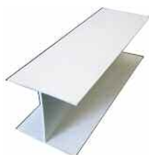
H-Bar Connector EPI0200