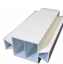
2” Dovetail Connector EPI1020