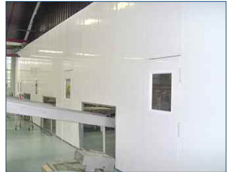
12 Foot High Wall with Double Swing Doors and Conveyors for Process Room