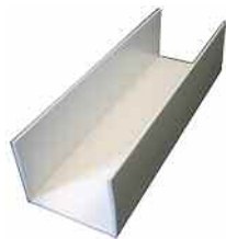
Base Channel EPI0100