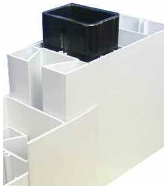
Steel Reinforced Panel Section Detail