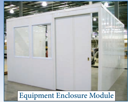
Equipment Enclosure Module