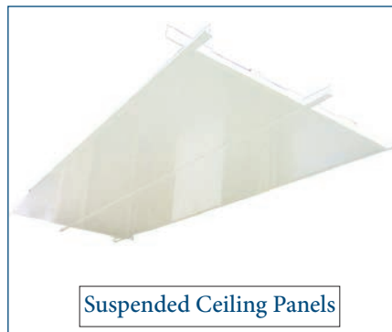
Suspended Ceiling Panels