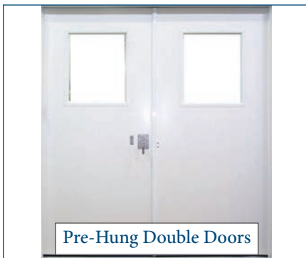
Pre-Hung Double Doors

Since 1992 Extrutech Plastics has been committed to developing unique products to serve the wide spectrum of our customers' distinctive needs. Our attractive, cost-effective panels will fill most special requirements - from clean rooms to laboratories. We can cover your walls and ceilings and replace your doors with superior products that your inspectors will love! Extrutech Plastics is continually working to improve current methods, while developing new ideas and concepts into innovative products that meet the ever-changing needs of our current and future customers. Call us for a free quote on your next project - toll free at 888-818-0118.