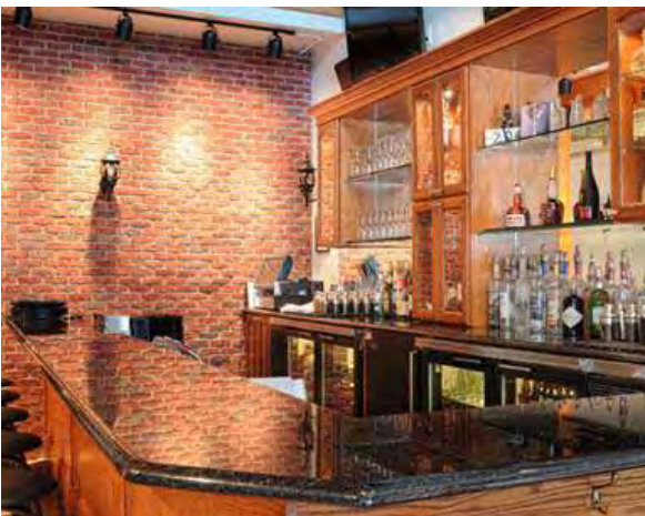
Indoor-Residential or Commercial Use