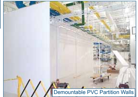
Demountable PVC Partition Walls

EPI9000 Wall Panels allows you the flexibility to construct clean rooms, equipment enclosures, partition walls or interior demountable partition walls quickly and easily. The 36-inch wide panels are available in custom lengths to fit your project requirements, and are perfect for corrosive and/or high moisture areas. We can custom design a clean room that fits your requirements. Add our plastic suspended ceiling system and doors for a complete low maintenance clean room, as shown.