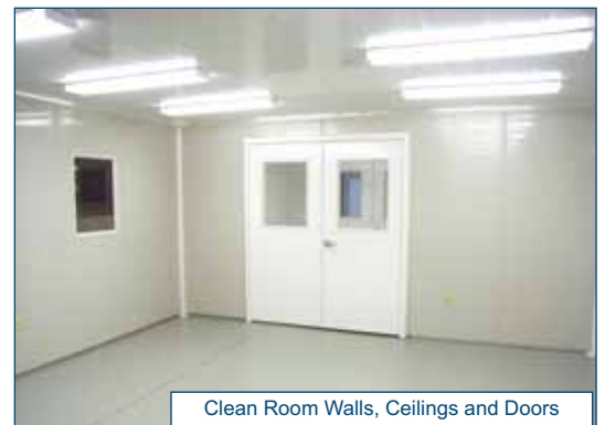
Clean Room Walls, Ceilings and Doors