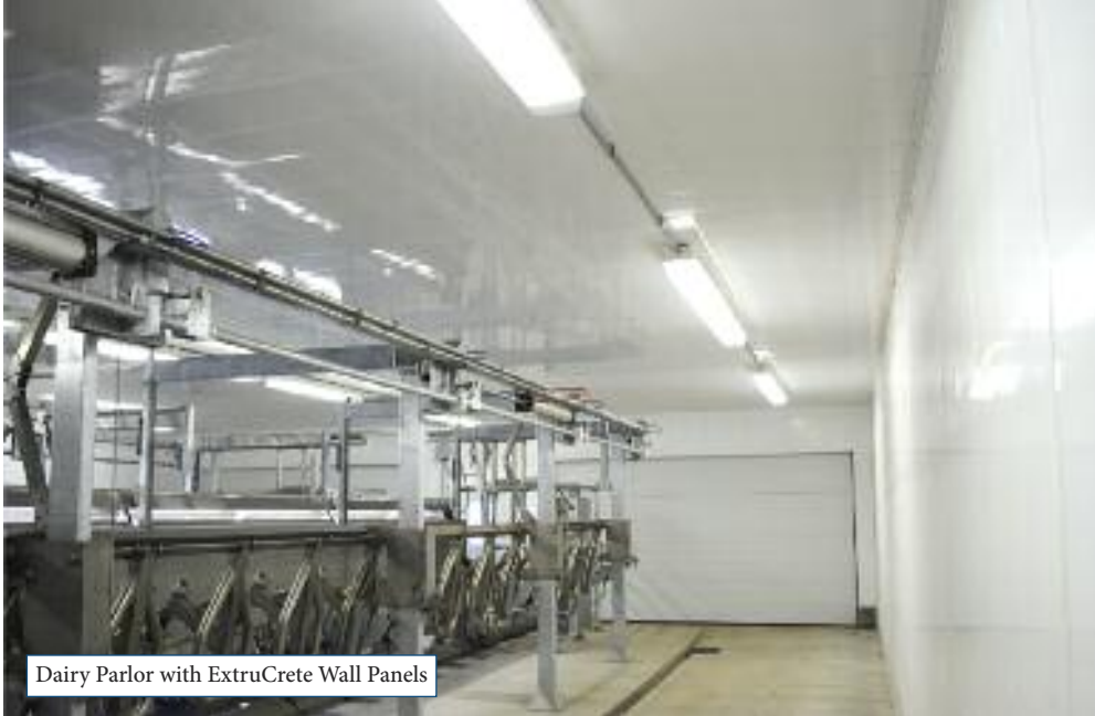
Dairy Parlor with ExtruCrete Wall Panels

ExtruCrete™ tilt-up panels create a superior sanitary surface that is designed for durability and cleanliness, combining the strength of concrete and the easy-to-clean finish of Extrutech Poly Board® panels. This creates a non-porous, prefinished, precast, structural panel that reduces the finishing and installation time of your construction project. The end result is a bright white, sanitary, easy-to-clean wall that will make everyone's day brighter.