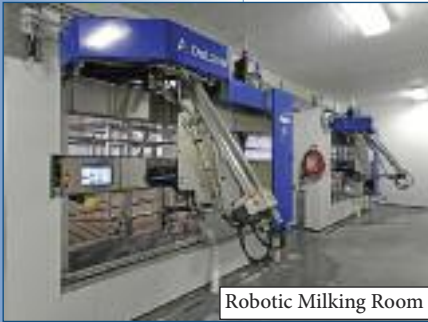
Robotic Milking Room

Poly Board® Wall and Ceiling Panels have a smooth, non-porous, white reflective surface and are available in 12" and 24" widths. The 12" P1300 Panel can be used on walls and ceilings, while the 24" P2400 Panel is recommended for great wall spans. Both panels have a tongue-and-groove design with a hidden nailing fin along one side that makes installation quick and easy, with no exposed fasteners, creating a great looking, easy-to-clean wall for years to come. Both panels have a ten year warranty and are Class A rated for smoke and flame.