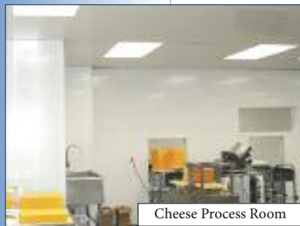
Cheese Process Room