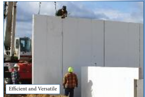
Efficient and Versatile