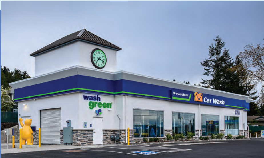
Car Wash Building Structure Using Extrutech Stay-in-place Concrete FORM Panels

Extrutech FORM System is a Stay-In-Place Concrete Form for poured walls. It is a quick setup, pre-cut system, that provides a smooth, non-porous, easy-to-clean, finished concrete structural wall in 6" and 8" thick forms. Insulated panels are also available. Ideal for areas where moisture can be a problem, making the Extrutech FORM System a labor saver for both the contractor and the owner.