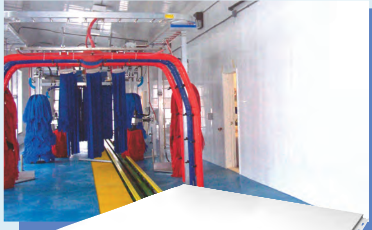
P2400-24" Wide Panel

These highly-reflective, waterproof panels are ideal for high-moisture areas. Panels install quickly and easily, with no exposed fasteners. Available in widths of 12 and 16 inches for ceilings, and 24 inches for walls. Panels are custom extruded, to the inch, based on the dimensions of your building. They are stain-resistant, require little to no maintenance and are easy to clean, as necessary. Colored panels – both standard and custom – are available to further enhance your wash.