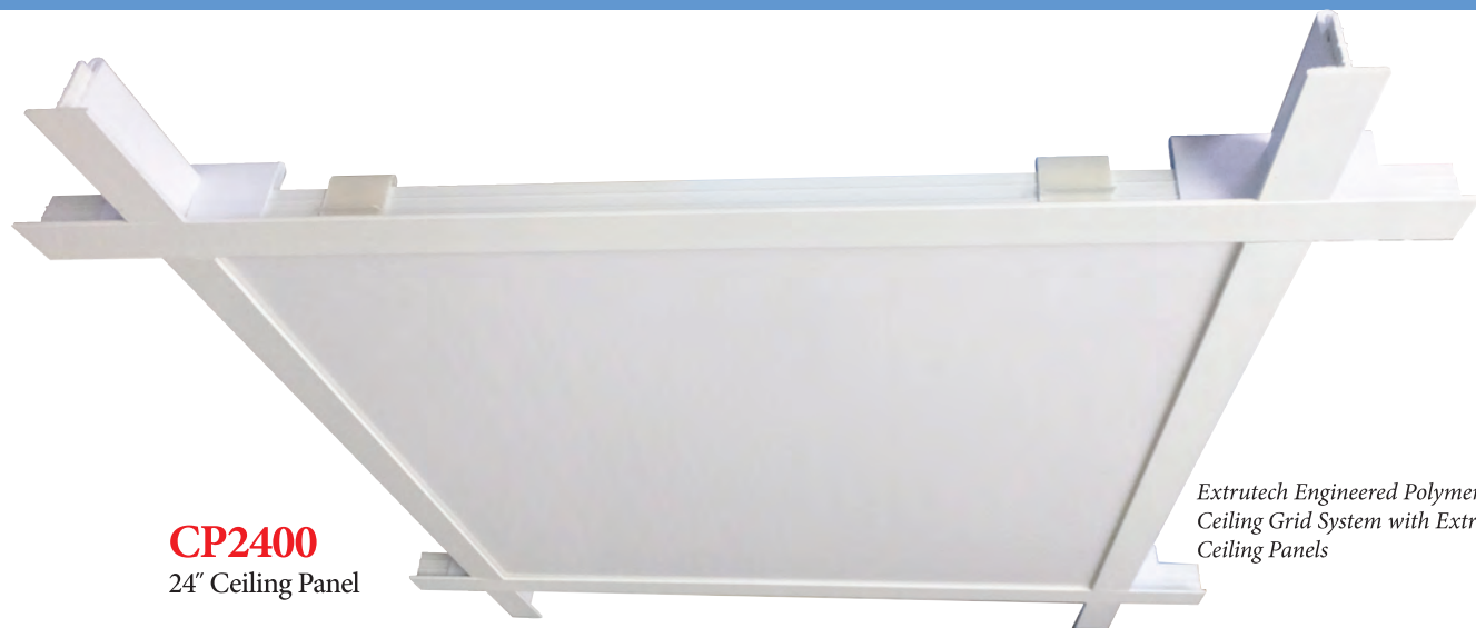
CP2400 24" Ceiling Panel

Corrosion-Proof Engineered Polymer Ceiling Panels and Grid System