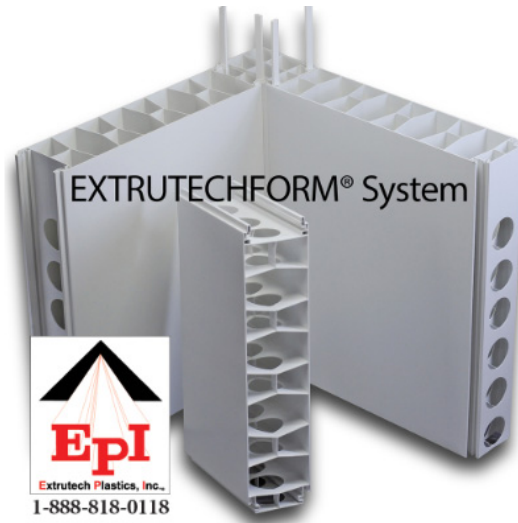
FIGURE 1—EXTRUTECH FORM - MODELS P624 AND P824