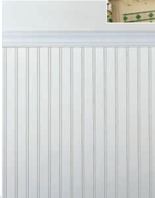
Part #P3000 12" Beaded Panel